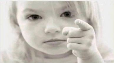
All you have to worry about is Location, Location, Location.

Don't worry about dying, you will live forever.