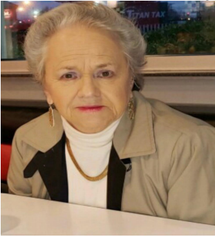
Author and Coach Marquis 2022 Whos Who in America