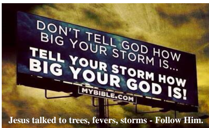
Jesus talked to trees, fevers, storms - Follow Him.

I Cor. 15:33 tells parents there is deception in this matter. Never count on your child as too wise to believe lies. " Be not deceived. Bad company ruins good morals." Their good intent to help someone may well be their downfall. That's how the devil works with youth... So, be vigilant! "If you have a goat, the devil knows how to get it! "